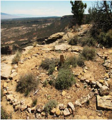
Recently discovered in Colorado