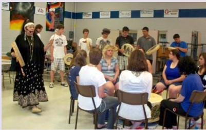
Sweet Thunder Medicine Wheel at an Ontario High school.