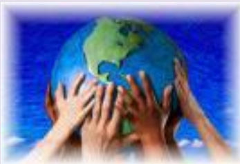
All One People

Finally, in 2012 , Teya Peya Productions hopes for all of you the magic of hearing your heart beat in tune with that of Mother Earth as represented by the drum. It takes you into inner worlds of dreams, experience, and learning. Mental, Spiritual. Emotional and Physical integrity flow together and you are in rhythm with all creation. Come to our programmes and let's experience this connection together. Wilwilaaysk , All My Relations.