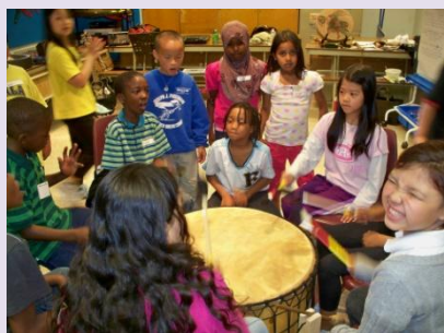
Bala Community School