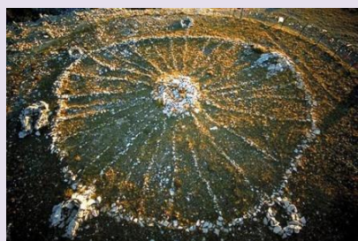
Big Horn, Wyoming