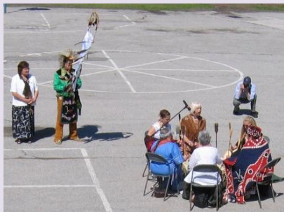
Moonstone Women's Big Drum

A Medicine Wheel was traditionally constructed by the laying of stones, each representing a character trait, (e.g. self-esteem), that was first discussed with the Elders and then laid in a circle in a specific pattern. As more teachings were introduced the medicine wheel grew larger and larger. Big Horn in Wyoming is the largest, measuring seventy metres across.