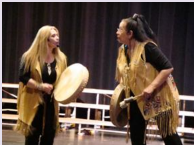
On Stage in Indiana

If you know anyone who wishes to be added to the mailing list (or removed), send us an email.