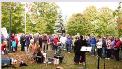
Thunderbird Native Theatre